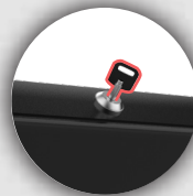
Key & Lock Security System