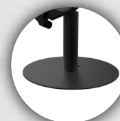
Sturdy Weighted Base