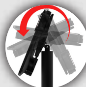
Flexible for desired Tilt