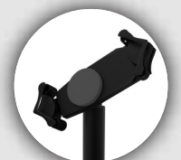
Adjustable Holder for a variety of sizes